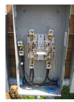
Item G: Meter Socket

ANY VARIANCE FROM THIS SPEC MUST BE PREAPPROVED BY EECA