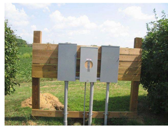
Photo of Sample Structure

ALL WIRING MUST CONFORM WITH THE NATIONAL ELECTRIC CODE AND ALL LOCAL CODES.